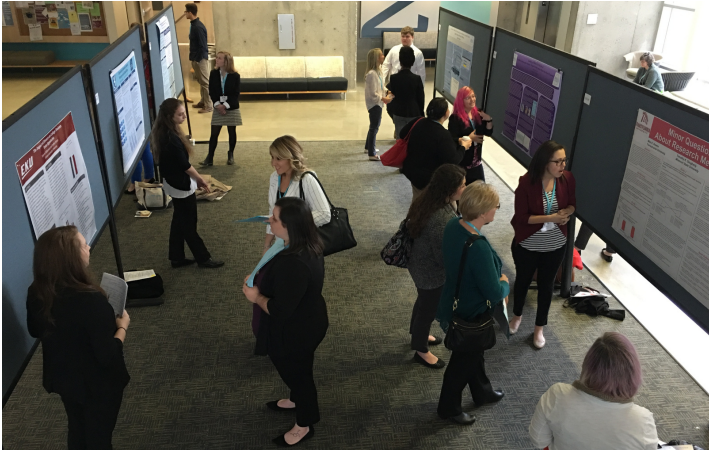
Students presenting their research at EKU.